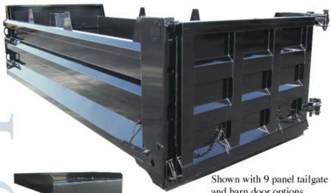
Shown with 9 panel tailgate and barn door options.