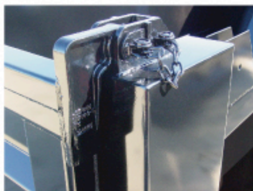
Tailgate hardware is offset cast steel with zerck grease fittings.