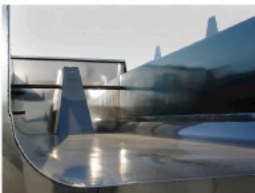
Shown is the inside of the 600T body and 12" floor to side radius.