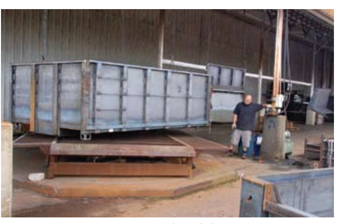
Dump bodies are transported by forklift from the assembly plant to the beginning of the conveyor line that will carry the body through the finishing process. This turning fixture accepts the dump body from the forklift and rotates it 90° so that it can more easily be attached to the conveyor line.