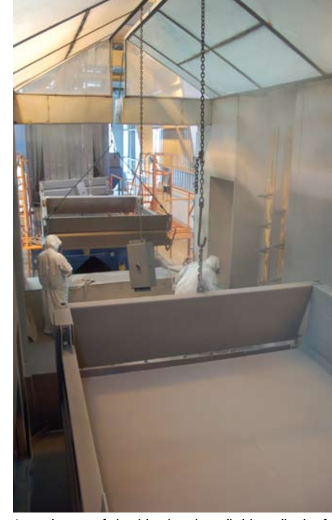
A powder coat of zinc-rich primer is applied immediately after bodies leave the blast booth, background.