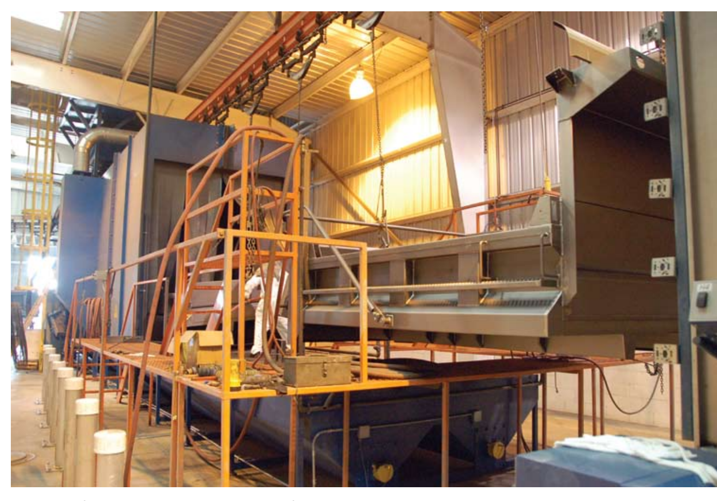
Godwin Manufacturing recently installed an automated finishing line to powder coat steel dump bodies. Shown here: a dump body leaves the new 70-ft-long Wheelabrator shot blast machine en route to the booth were a zinc-rich primer is applied.

Putting that line in place was a major undertaking. It involved buying a new Wheelabrator shot blast machine, new automated paint booth, additional oven, and the