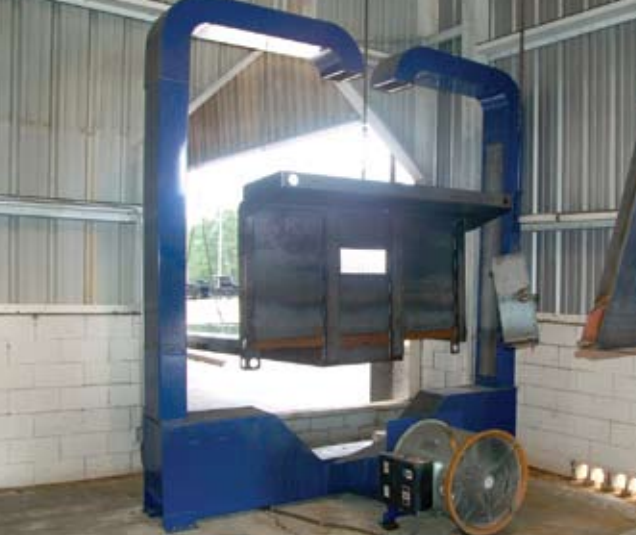
After being cleaned, forced air speeds the drying process, reducing the possibility of flash rust.

"Essentially, you are mixing zinc with epoxy," Godwin says. "PPG won't tell us how much zinc is in the powder, but my guess is that it's well above 90%. The epoxy acts as Trailer/Body Builders July 2011