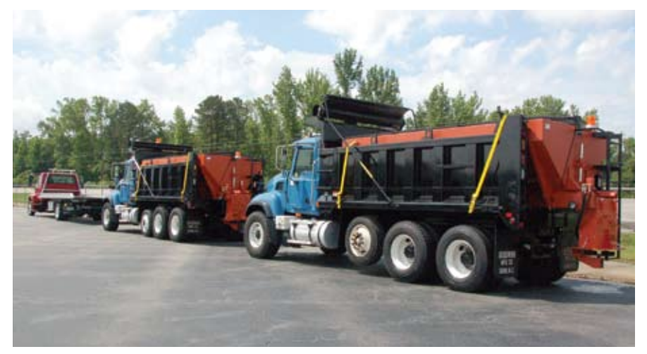
Completed bodies are ready for work. Godwin installs bodies for customers based within 250 miles of Dunn NC and relies on distributors beyond that radius.

"Before we jump into something, we really try to think it through," he says. "It may not be a good fit for other companies, but we have to ask ourselves 'Does it make good sense to us?' "