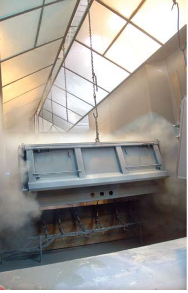
Electrostatic guns charge the powder, creating a cloud that is attracted to steel.

The inside of the shot blast machine is a pretty violent place. At its peak, the machine fires more than two tons of shot per minute at whatever passes through. The shot travels at the velocity of a bullet fired from a .22 caliber rifle. But as the result of all that shooting, bodies and subassemblies emerge from the blast booth with a white metal finish, free from impurities and with ideal texture to which the powder coat can bond.