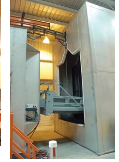
Primed bodies move into an oven that causes the powder to gel and to bond to the substrate.