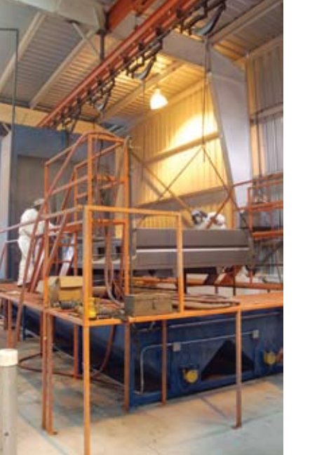
Compressed air removes the remaining shot that did not fall out when the body was hoisted up.

After being shot blasted, component parts and fully assembled bodies are conveyed a few feet forward to the automated powder booth. The conveyor system moves the products through the booth where both manual and 26 automated electrostatic guns envelop the bodies in a cloud of powder, producing a coat of zinc approximately two mils thick.