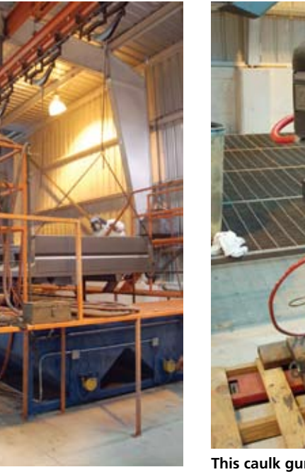
caulk to seal out water as the body comes out of the first oven. As the body cools from the oven, the caulk hardens.

"Both ovens produce in excess of 15 million Btus per hour when in operation," Godwin says. "That calculates to