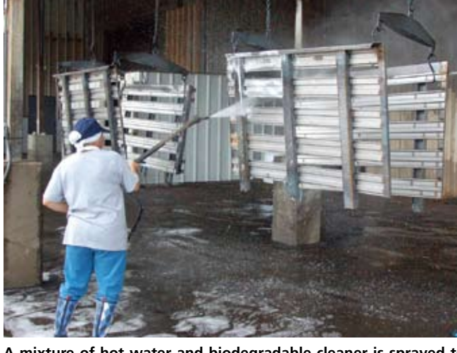
A mixture of hot water and biodegradable cleaner is sprayed to remove surface contaminants. By sending a clean body to the shot blast booth, the shot can be recycled more effectively.