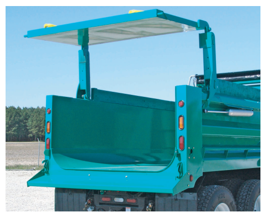
Optional air operated high lift tailgate with other options shown.