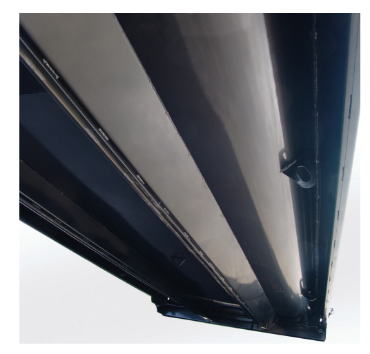
Above is the 600U/T's crossmemberless understructure and formed long sills with rubber cushion.

1/4" AR 450 floor in lieu of 3/16"1/4" AR 450 sides3/16" 50K minimum yield steel sides, front and gate3/16" AR 450 sides and gateAir high lift or two-way barn door tailgate