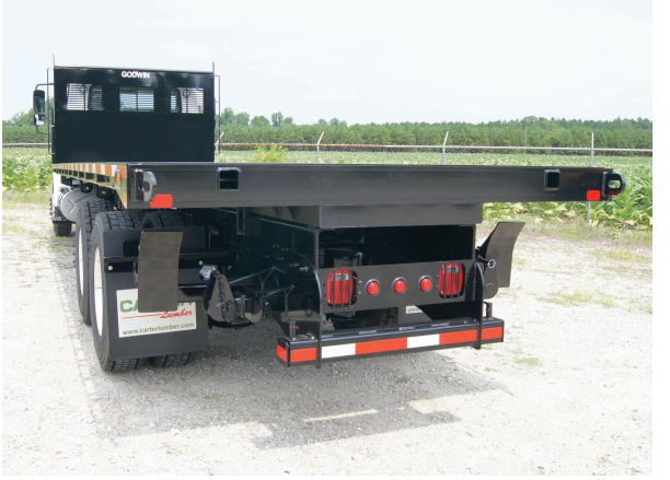
Navigator brand kit

Godwin's Truck Mounted Forklift Carriers are easily installed in 6 hours or less!