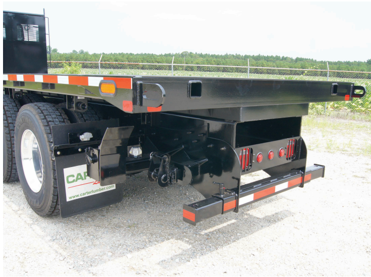
Carrier comes with integrated storage tube for storing hanger kit for carrier. Hanger kit requires no shop wrenches and is adjustable front to back of body.