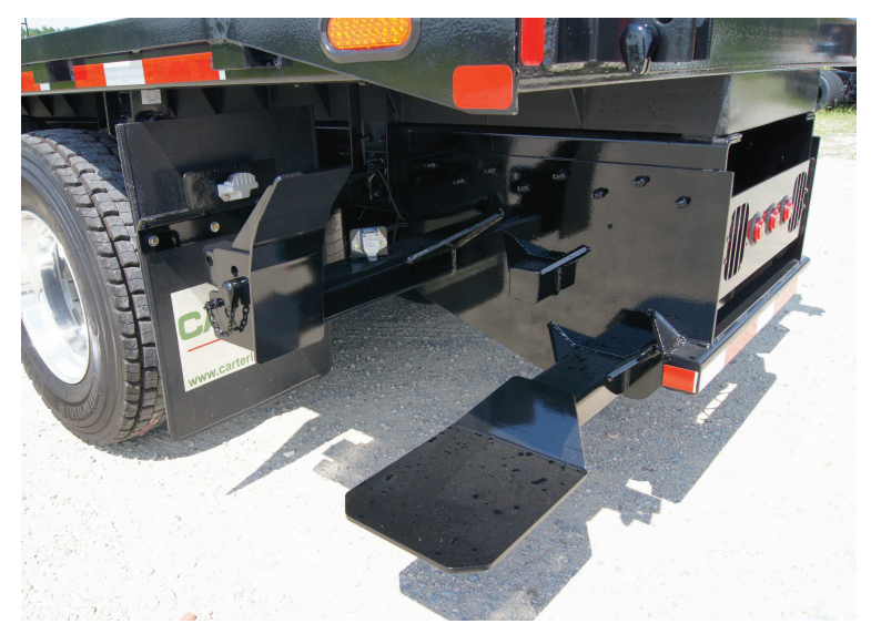
Wheel adjustment can be adjusted in increments of 1-1/2" according to diameter of the wheel. No tools needed, just remove the pin to adjust to as needed. All pins are tapered to self-align the holes when adjusting to another wheel size.