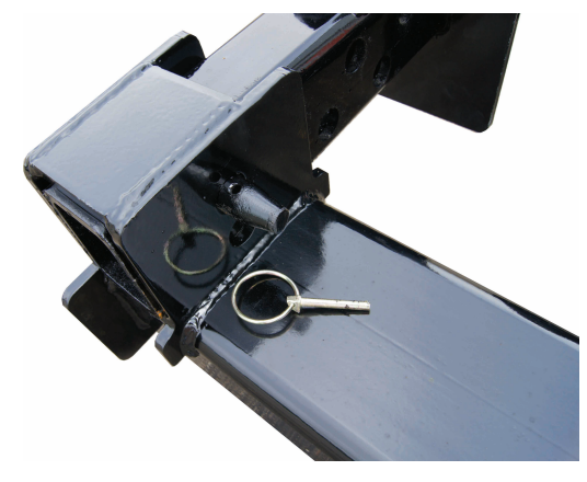
When extending or retracting the wheel chock, you only remove and replace pin to put snap ring in place.