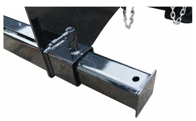
On the ICC Bumper, to retract and extend, simply turn the spring loaded positive latching click pins. No tools required.